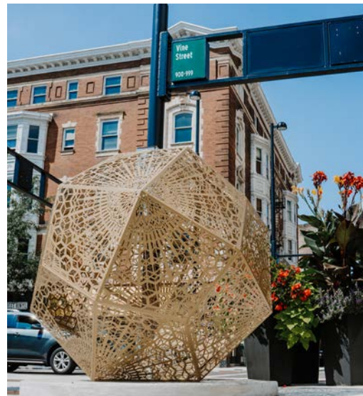
THE HYBYCOZO ART INSTALLATION AT COURT STREET PLAZA

In December, local artists residents and visitors gathered to help paint a mural along the Plaza that was designed and drawn by a local paint-and-sip company owner. The community-curated mural paid homage to the city of Cincinnati, and the event featured local musicians, coffee and take-home crafts. The first year of programming at Court Street Plaza was possible because of the generous contributions from sponsors, and more programming is in the pipeline for 2022.