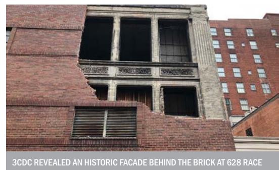
3CDC REVEALED AN HISTORIC FACADE BEHIND THE BRICK AT 628 RACE

Group President, North America The Procter & Gamble Company