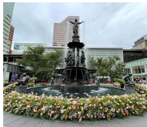
THE TYLER DAVIDSON FOUNTAIN TURNED 150 IN 2021

Attendance picked up as the year progressed and Fountain Square ultimately played host to 333 3CDC-produced and third-party events from January to December. The realized goal of a full year of events in 2021 was made possible due to the generosity of our sponsors, and 3CDC looks forward to the same thing in 2022.