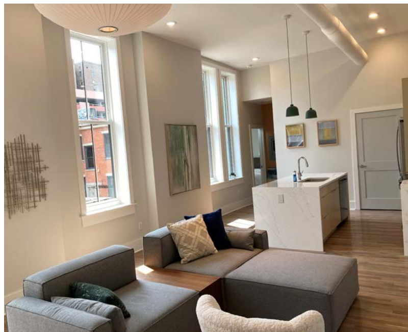
MOORE FLATS, PART OF THE COURT STREET SOUTH CONDOS PROJECT

spaces in these building wrapped up in November 2021, and complements the renovation of both the new Court Street Plaza as well as the recently finished Court Street Condos located on the north side the street.