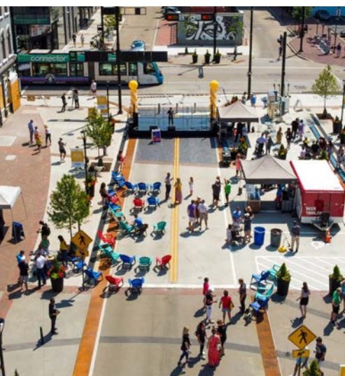
COURT STREET PLAZA

In early 2019, a Pedestrian Task Force was created in a joint effort with the City of Cincinnati to pinpoint pedestrian and traffic improvement needs along Court Street, facilitate community engagement, and, along with Human Nature and 3CDC, develop design options for an updated plaza. The result is Court Street Plaza, a reimagined civic space with widened sidewalks, making the area more pedestrian-friendly, and allowing for more outdoor dining options for restaurants located within the plaza. The new space also includes a reconfigured festival-style street, allowing for vehicular closure of the street and opening the entire street to pedestrians for organized events.