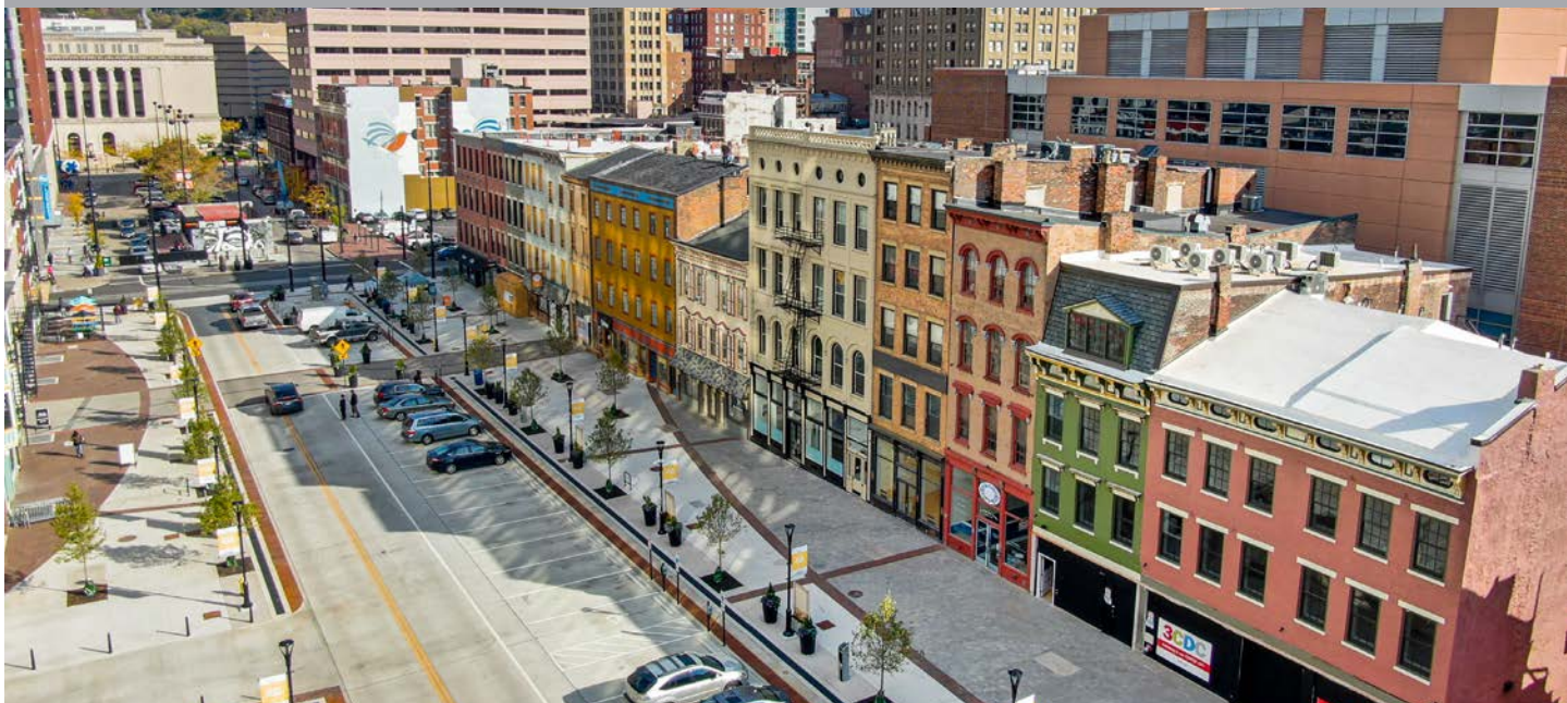
COURT STREET PLAZA AND THE STANLEY & MOORE FLATS WERE BOTH COMPLETED IN 2021, REIMAGINING THIS AREA IN THE NORTHERN SECTION OF THE CENTRAL BUSINESS DISTRICT

3CDC REMAINED COMMITTED TO PUTTING FORWARD AN AMBITIOUS DEVELOPMENT PROGRAM IN 2021 , despite the fact that the economy had not fully recovered from the effects of the pandemic that started in 2020. The organization placed the primary focus of its development pipeline on three targeted areas in the urban core: the Convention Center District in the southwest corner of the Central Business District (CBD), the northern section of the CBD, and Over-the-Rhine (OTR) North of Liberty. Each area featured projects that were either completed or under construction in 2021, as well as others in pre-development.