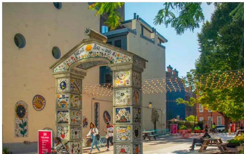
THE RENOVATED IMAGINATION ALLEY REOPENED TO THE PUBLIC IN SEPTEMBER 2021

In Winter, Founders Forest returned to Imagination Alley as an event under the FOUND series. Visitors could stroll through the alley, seeing dozens of holiday trees, including a main tree that was sponsored by Procter & Gamble and the Make-A-Wish Foundation.