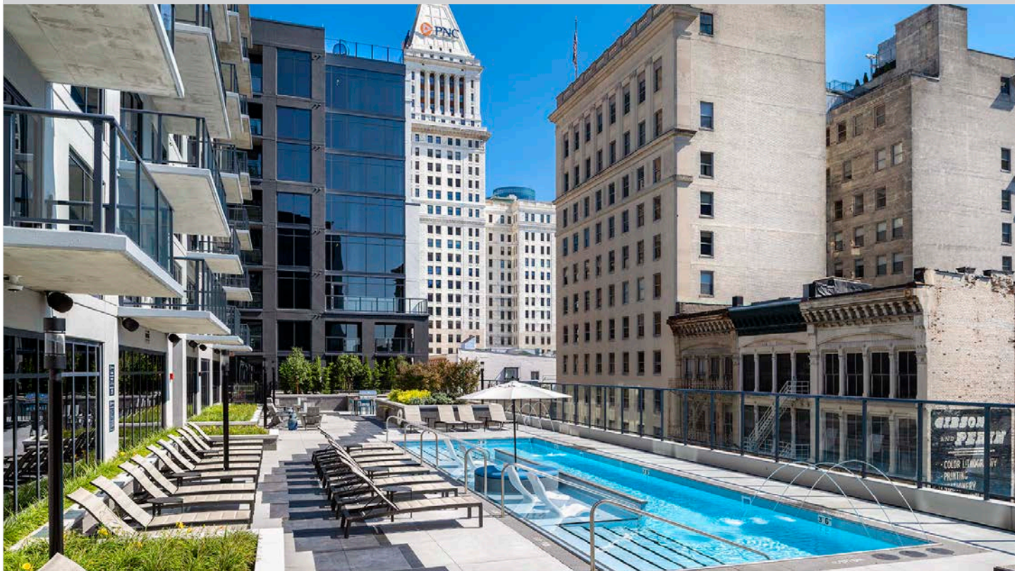
4TH & RACE WAS COMPLETED IN MID-2021