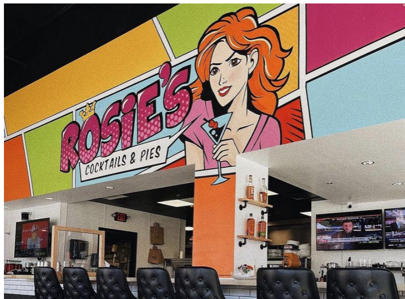
ROSIE'S COCKTAILS AND PIES