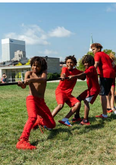
SUMMER CAMPERS AT ZIEGLER PARK

The season at Ziegler Pool ended with the fifth annual Dog Swim on September 12, with proceeds going to the Everybody In program. More than 115 dogs enjoyed frolicking in the water before the Pool closed for the rest of the year. Through generous contributions from our sponsors, the Everybody In program makes swim lessons, swim team, summer camp, and other programs accessible to neighborhood youth. This allows Ziegler Park to serve the full community, including many children who could not afford these programs if there was a fee associated with participation.