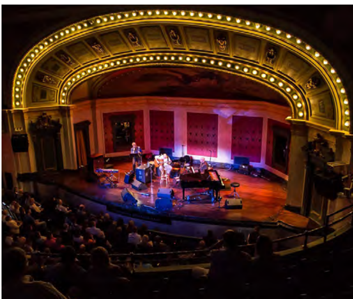
MARC COHN AT MEMORIAL HALL

However, its regular programming is what makes the Hall a true community gathering space, and without the generous support of our sponsors, programs like these would not be possible. Their dedication both to the OTR community and to the arts is what gives us the ability to make such experiences accessible to all.