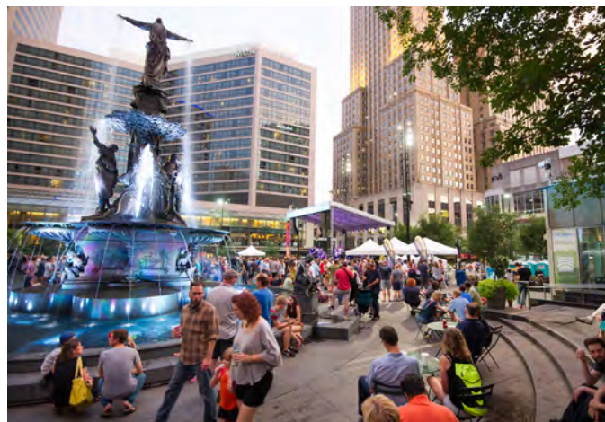
FOUNTAIN SQUARE LIVE

Fountain Square opened on October 27. A tradition in Cincinnati, over 59,000 skaters made their way to the rink over the course of the 2017-18 season.