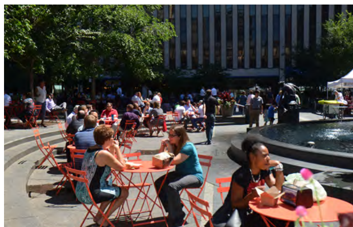
FOUNTAIN SQUARE STRAUSS TROY MARKET

Although many of the Square's most popular events continued from years passed, several new events made their debut in 2017. In April, free spinning classes by Cycle Bar were offered every Tuesday evening through the FSQ Fit program, followed by an exciting new musical addition to the BB&T Spring Series in May – FSQ Flashback. This series featured numerous well-known local bands, groups and