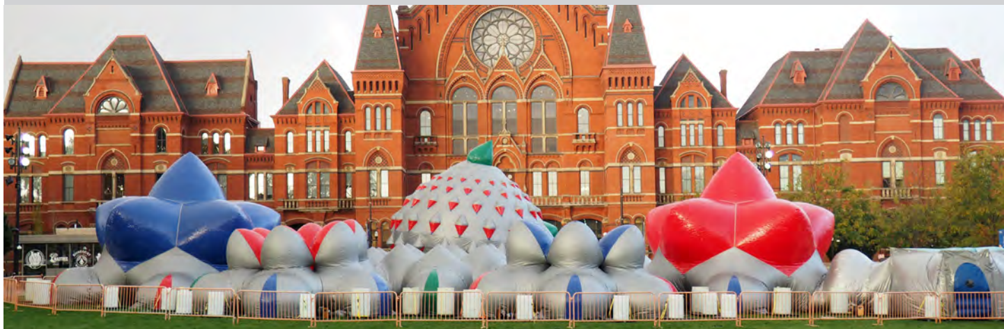
THE ARCHITECTS OF AIR INSTALLATION DURING THE BLINK FESTIVAL

2017 was another great year at Washington Park, as children and adults alike gathered in the space for 549 total events – 483 of which were produced by 3CDC, in addition to 66 third-party events.