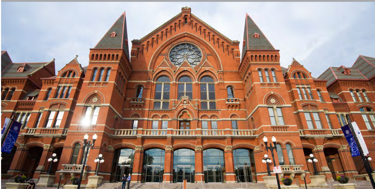
CINCINNATI MUSIC HALL

CONTINUING ON ITS MISSION TO REVITALIZE CINCINNATI'S URBAN CORE, 3CDC had another positive year in 2017. With several large projects wrapping up, new projects beginning, tenants opening their doors for the first time, and a vast array of new programming at some of Cincinnati's most intensely utilized civic spaces, this past year has been full of excitement. The renovation of two major civic spaces in Over-the-Rhine – Music Hall and Ziegler Park – was a key focus of the organization in 2017. Though just recently completed, Ziegler Park has already started contributing to the renaissance in OTR, and Music Hall has returned to its former glory.