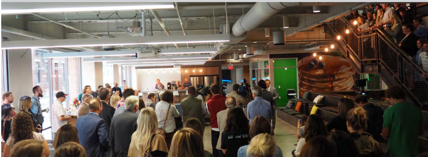
EMPOWER MEDIAMARKETING GRAND OPENING