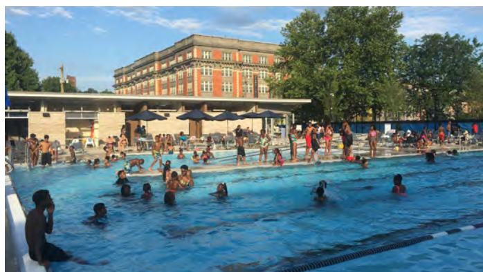
ZIEGLER PARK POOL

Without the support of our generous sponsors, we would not have the ability to offer such programs to neighborhood youth and their families. It is because of their philanthropic spirit and dedication to making Ziegler Park a place of inclusion that we are able to offer pool access and free programming to people of all income levels.