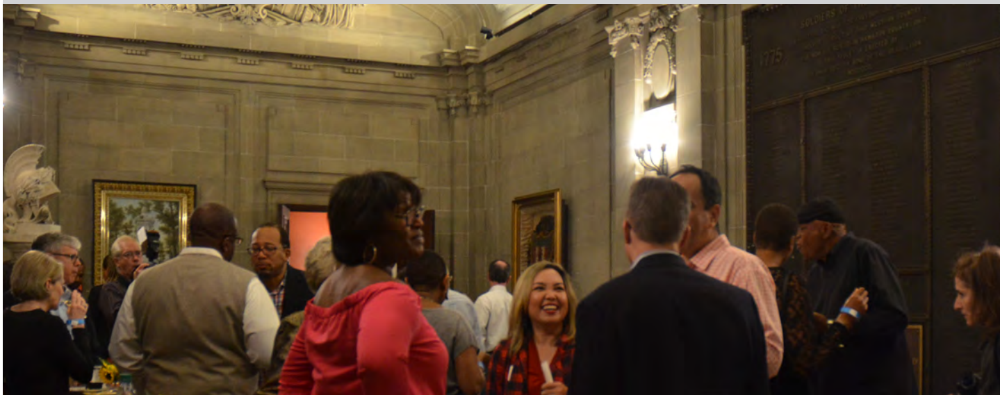
MURDER MYSTERY IN MEMORIAL HALL'S PARKVIEW ROOM

2017 was Memorial Hall's first full year of operations following its recent $11 million renovation. The Hall reopened to the public in December of 2016, unveiling the beautifully restored historic space. The building's amenities were enhanced to allow for year-round programming of the Hall, with a goal of helping it realize its full potential. Prior to the renovation, the now 556-seat performance space and event venue lacked air conditioning and handicap accessibility, among other key features, and was long overdue for upgrades throughout.