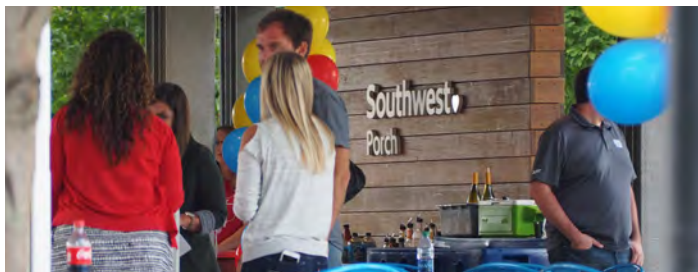
SOUTHWEST PORCH OPENING

Formerly known as “The Deck,” the Southwest Porch made its debut in the summer of 2017, as Southwest Airlines came on board as its sponsor. The new porch was rebranded, introducing a color scheme