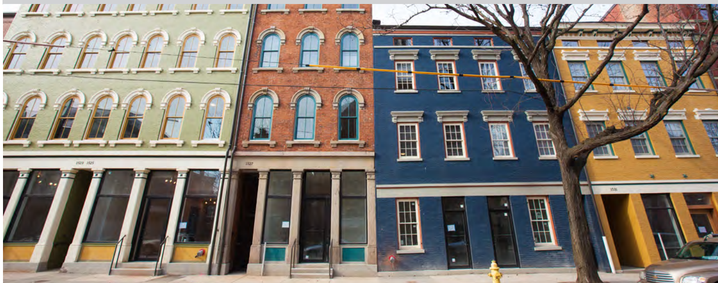
ABINGTON RACE & PLEASANT