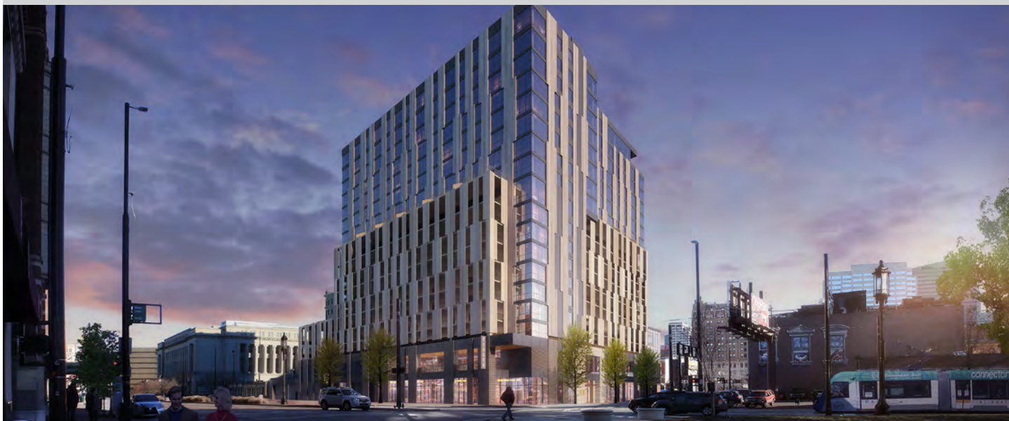
COURT AND WALNUT RENDERING