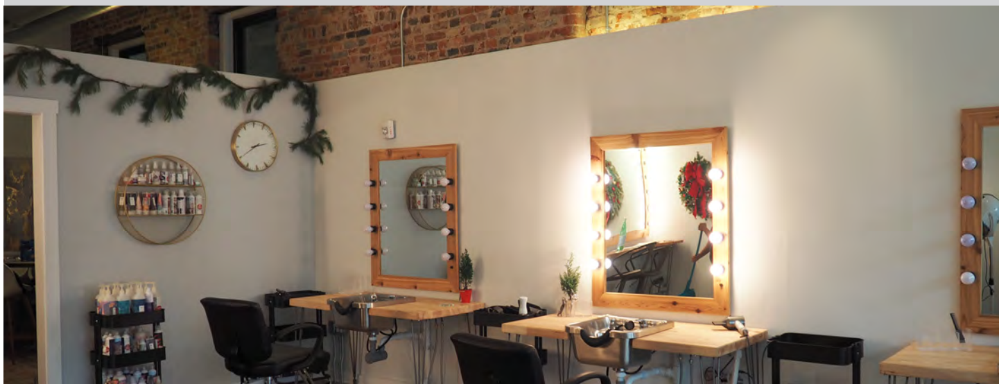
AV BEAUTY BAR

Over time, 3CDC has restored a number of old buildings in both downtown Cincinnati and OTR, preserving their historic character, renovating them back to their intended use, and retaining ownership of the commercial spaces upon completion. 3CDC encourages entrepreneurship, celebrating the talents of local business people – from artists to restaurateurs, and beauticians to baristas – by filling these storefronts with local concepts whenever possible. The following list of businesses opened their doors in 3CDC-owned spaces in 2017, unless noted otherwise.