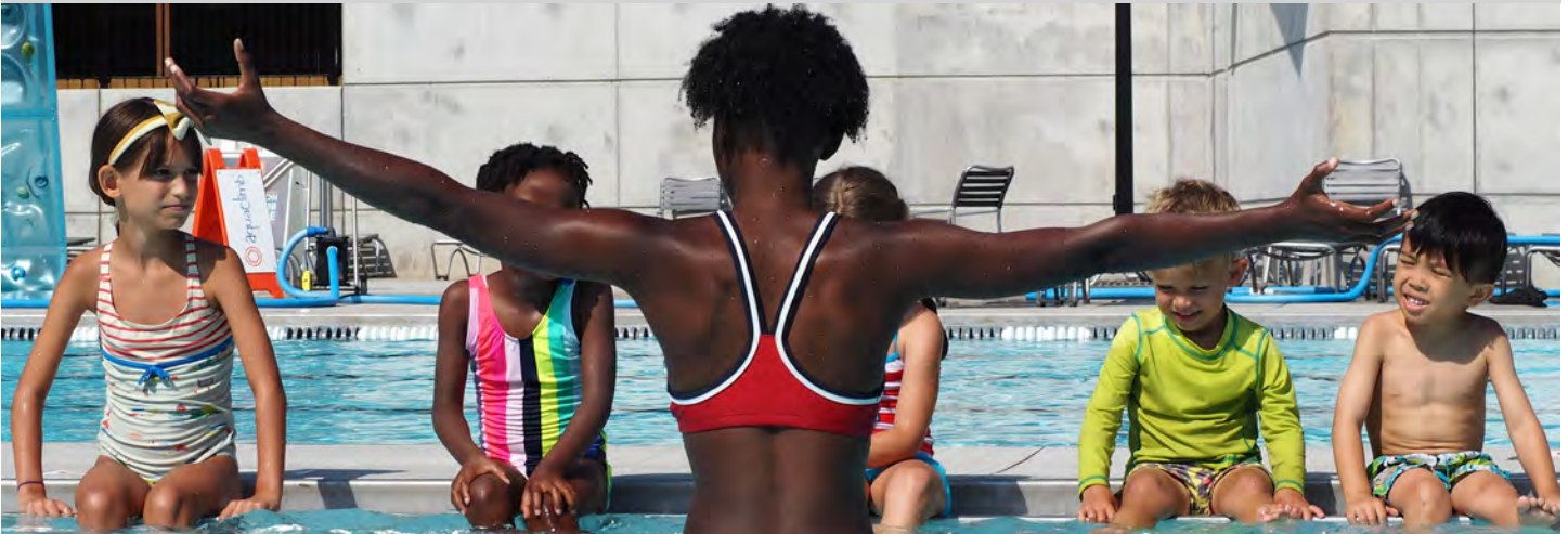
FREE SWIM LESSONS AT ZIEGLER PARK