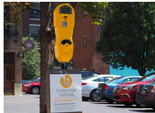
DONATION STATION AT CORNER OF 12TH AND VINE STREETS

In August, in partnership with the City of Cincinnati and Downtown Cincinnati Inc. (DCI), 3CDC installed five repurposed parking meters in various high-traffic locations throughout OTR and the CBD. The meters serve the sole purpose of collecting funds for the GeneroCity 513 program, an initiative designed to help connect panhandlers with the services they need. Rather than accepting payment for parking, the meters collect charitable contributions, in the form of coin or credit card. They are seen as an alternative to giving money directly to panhandlers that provides the peace of mind that comes with knowing exactly where one's dollars are going.