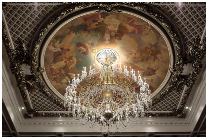
MUSIC HALL'S CHANDELIER INSIDE SPRINGER AUDITORIUM

• Boca Restaurant received the Best Award of Excellence from Wine Spectator for its dedication to wine, including about 350 selections with vintage depth or breadth in one or more regions. • The Allison, one of 3CDC's newest mixed-use developments, received a Merit Award from the American Institute of Architects (AIA), recognizing it as the Best in Residential Design for Multiple-Unit Housing. • The Ohio History Connection Honored 3CDC with a Historic Preservation Achievement Award for the rehabilitation of the Globe Furniture Building. • Conde Nast Traveler recognized the 21c Museum Hotel Cincinnati as one of the best in the world, ranking it number five in the Midwest. • The Cincinnati Preservation Association honored seven rehabilitation projects in Greater Cincinnati at its 53rd Annual Preservation Awards Ceremony. The $11 million renovation of Memorial Hall, which was overseen by 3CDC and played host to the ceremony, received one of the awards.