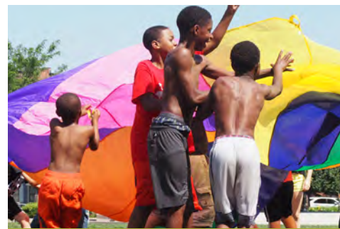
WASHINGTON PARK POP UP PLAY

Just as in years past, events at Washington Park, both new and old, have continued to gain popularity with both neighborhood folks and visitors to the city. And, as with Fountain Square, the free programming offered at Washington Park would not be possible without the support of our sponsors, who go above and beyond to make this a space that everyone can enjoy.