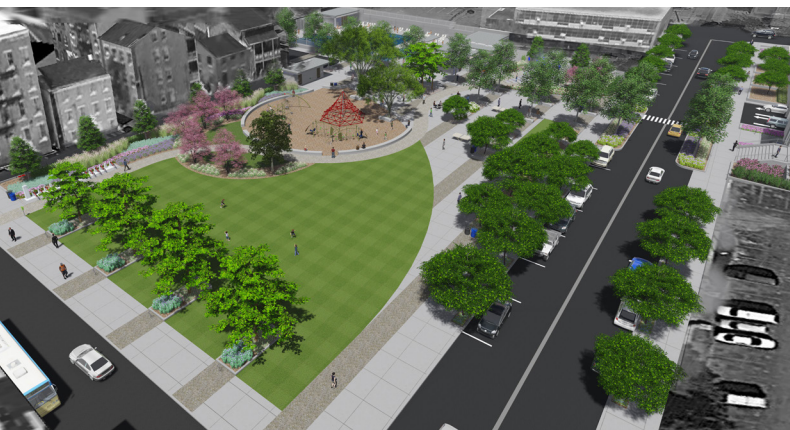
ZIEGLER PARK RENDERING

3CDC made a great deal of progress on the renovation of Ziegler Park in 2015, ultimately breaking ground on the project in the first quarter of 2016. To get to that point, 3CDC – along with the Cincinnati Park Board, Cincinnati Recreation Commission, City of Cincinnati and the