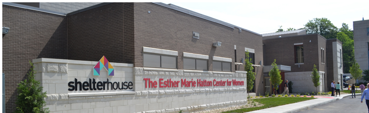
THE ESTHER MARIE HATTON CENTER FOR WOMEN

Designed to meet the unique needs of single homeless women, the $8.4 million Esther Marie Hatton Center for Women was completed in June 2015. Clients moved into the new 20,000-square-foot, 60-bed facility on Reading Road immediately after construction was finished.