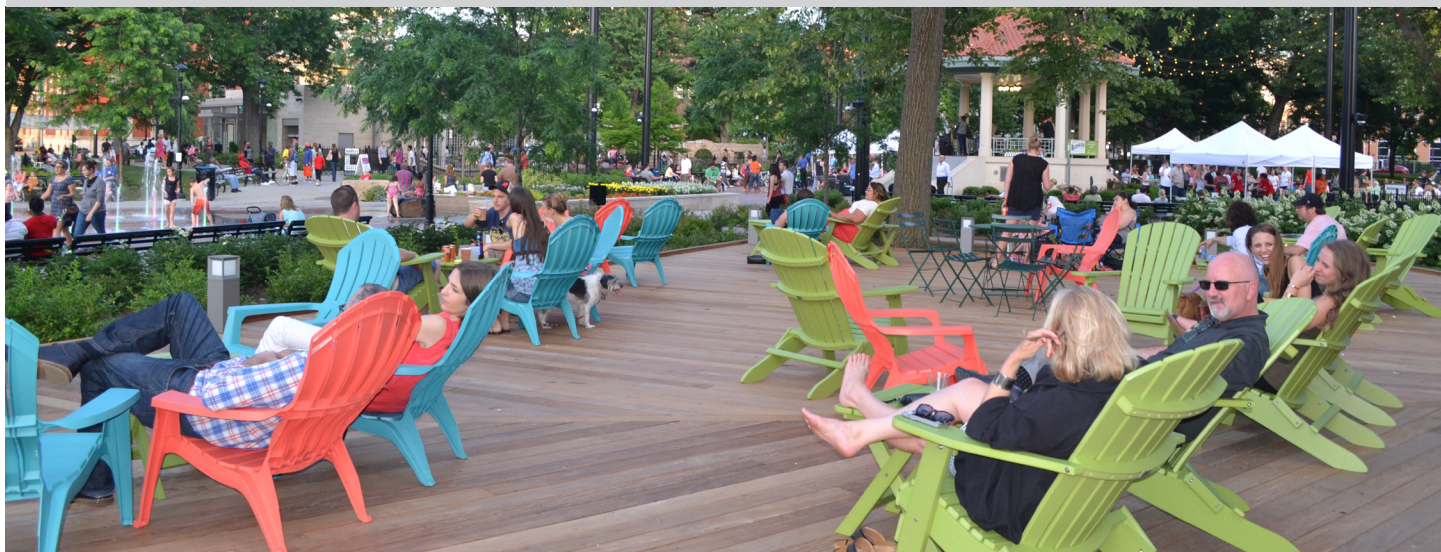
WASHINGTON PARK DECK