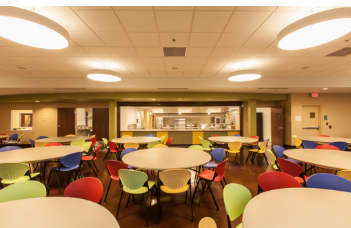
CITY GOSPEL MISSION

Construction on the first building of City Gospel Mission's new $14.6 million, two-building campus was finished in April 2015.