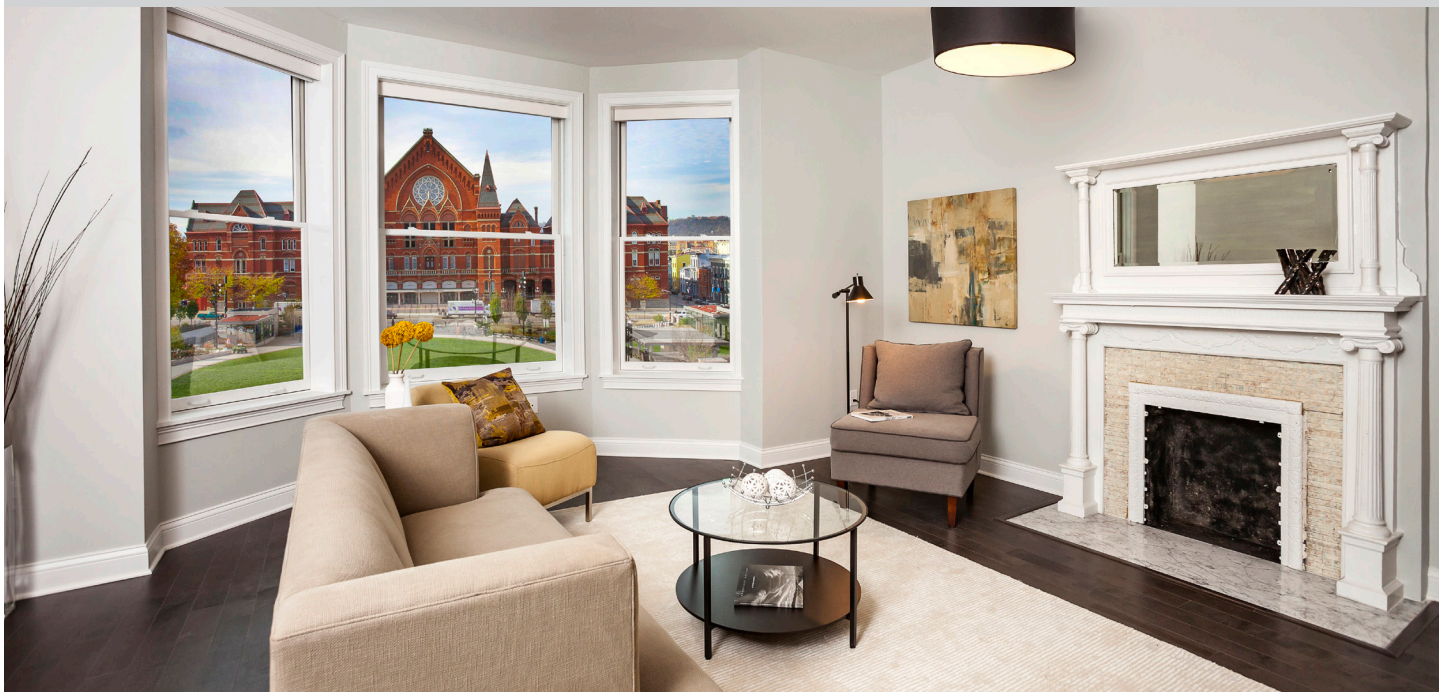
PARKSITE CONDOS / PART OF OTR PHASE VI