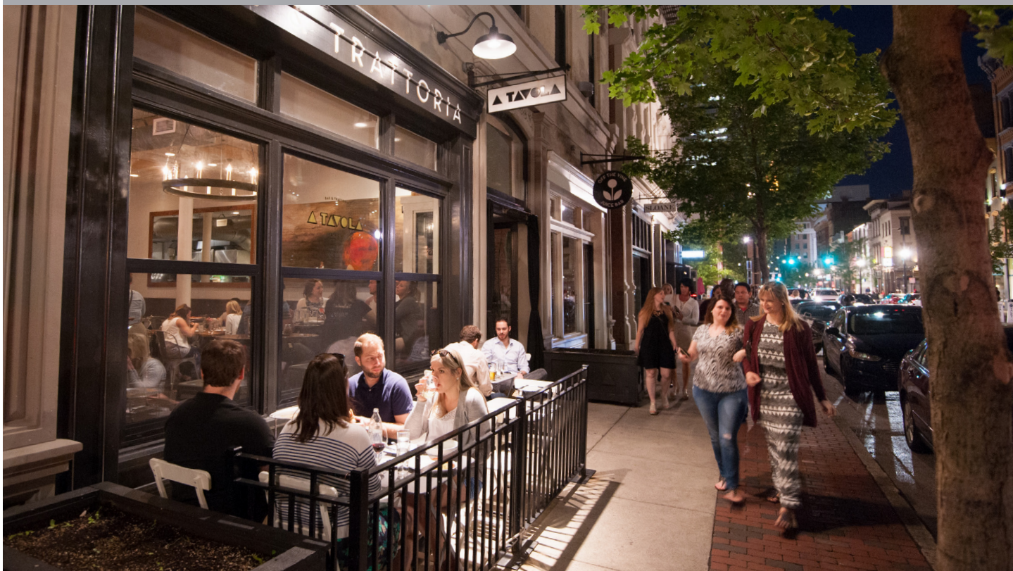
VINE STREET NIGHTLIFE

3CDC IS A REAL ESTATE DEVELOPMENT COMPANY that operates under a 501(c)3 nonprofit status with the primary mission of revitalizing Cincinnati's core neighborhoods of Downtown and Over-the-Rhine. In carrying out this mission, 3CDC focuses its strategy on nonconventional investments that for-profit developers would not, in most instances, undertake, such as civic spaces, cultural facilities, severely blighted properties, affordable and special needs housing, speculative condominium development on a large scale, and retail and office developments targeted to local, non-credited tenants.