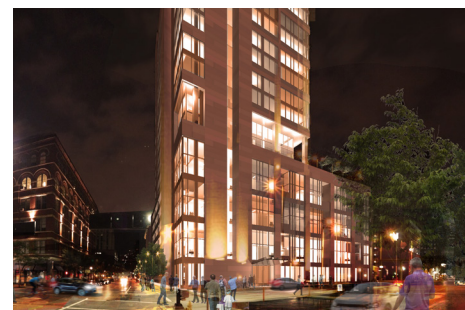
8TH & SYCAMORE RENDERING

Construction commenced on the mixed-use 8th & Sycamore project in October 2015. The project will feature a 500-car parking garage and 7,000 square feet of commercial space, both of which 3CDC is developing, as well as a 131-unit residential tower above the garage that North American Properties will construct. The 3CDC portion of the $53 million project is estimated to cost $17 million, with the garage expected to be completed in the summer of 2016.