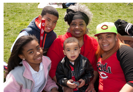
REDS OPENING DAY IN WASHINGTON PARK

With each passing year, Washington Park's popularity and recognition as a regional destination continues to grow. To keep up with that growth, 3CDC continues to add new programs and amenities each year, and our generous sponsors continue to support these efforts through commitments of time, effort, and capital.