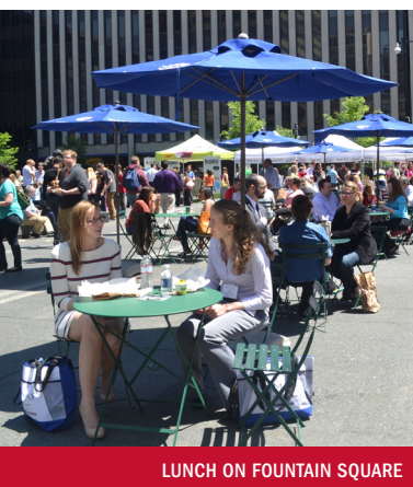
LUNCH ON FOUNTAIN SQUARE

In 2015, Fountain Square hosted 373 events produced by 3CDC, and 165 third-party events, welcoming over three million visitors to downtown Cincinnati. The Square hosted thousands who were in town for Major League Baseball's All-Star festivities, treating guests to free, family-friendly programming, including concerts, activities and watch parties all weekend long.