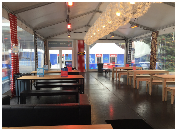
LYKINS ENERGY SOLUTIONS WARMING TENT AT THE FOUNTAIN SQUARE ICE RINK

One of the biggest improvements to the customer experience at the Ice Rink this year was the addition of the new 60-foot Lykins Energy Solutions Warming Tent on the west side of the rink. Furnished by IKEA with wooden tables and benches, the new tent provided patrons with a warm spot to watch all the action on the ice. The new warming tent is also available for private rental during rink season.