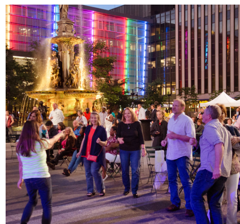
WINE MAKERS LIVE

While playing host to hundreds of free family-friendly events in a single year is certainly no small feat, it would not be possible without the generous support of our sponsors. Their continued commitment to helping us program the Square is the lifeblood to what has become the beating heart of downtown Cincinnati.