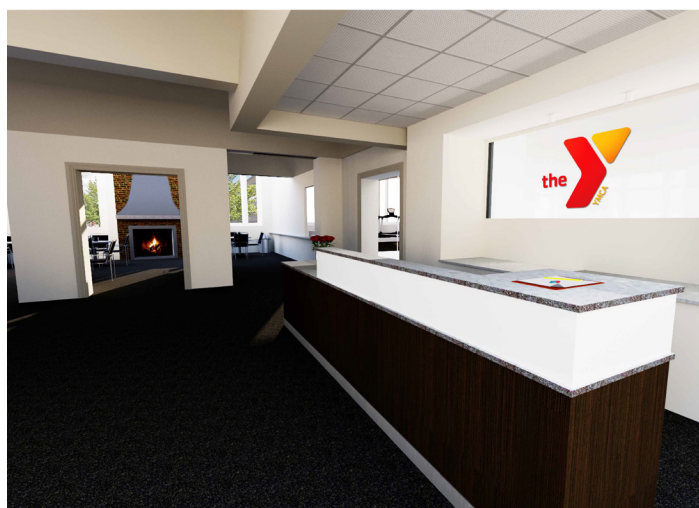
CENTRAL PARKWAY YMCA RENDERING

Work on the $27.5 million renovation of the Central Parkway YMCA officially started in the summer of 2015. A collaboration between the YMCA of Greater Cincinnati (YMCA), 3CDC and The Model Group,