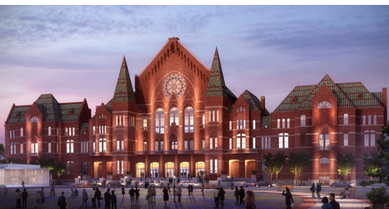
MUSIC HALL RENDERING

After years of discussion, planning, and fundraising, renovation work on Music Hall ultimately began in summer 2015. In August, construction crews removed a structural column behind the stage and performed underground soil stabilization work. All resident companies remained in the building until November, at which