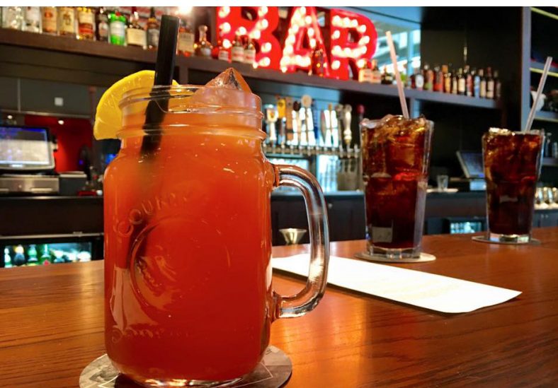
AMERICANO BURGER BAR

A social intelligence agency that leverages brand activation, event production, digital platforms, media and content design to grow a brand’s culture, Agar moved into its new home at 1205 Walnut Street in February 2015.