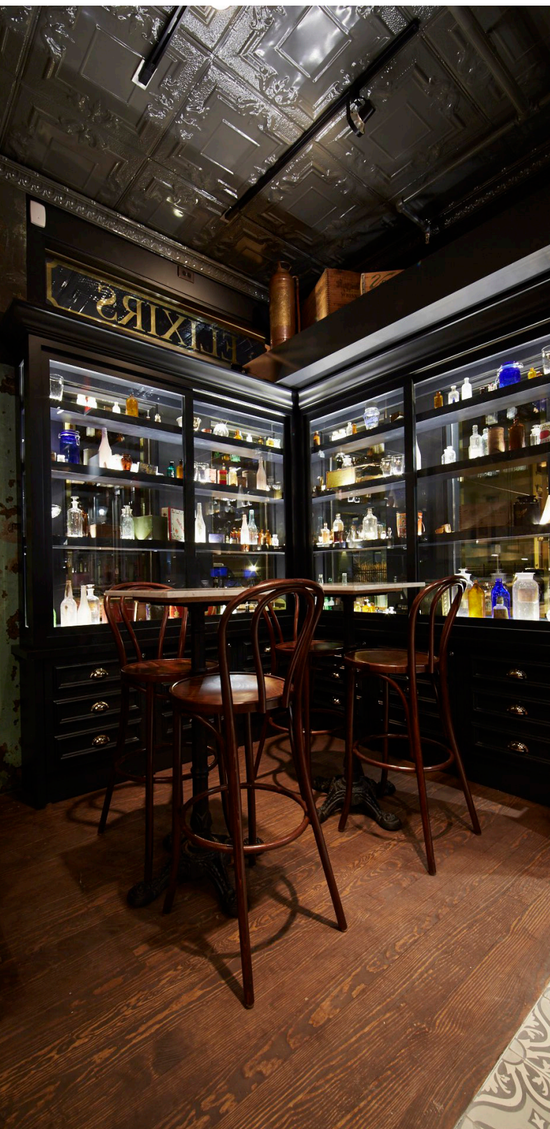
SUNDRY AND VICE