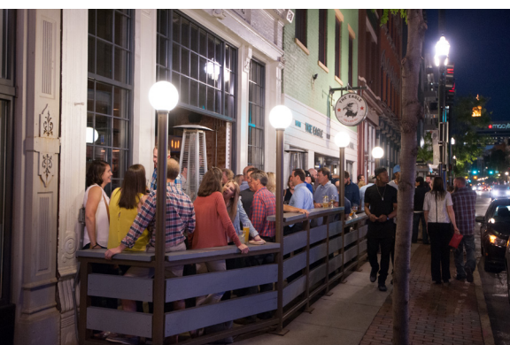
VINE STREET AT DUSK