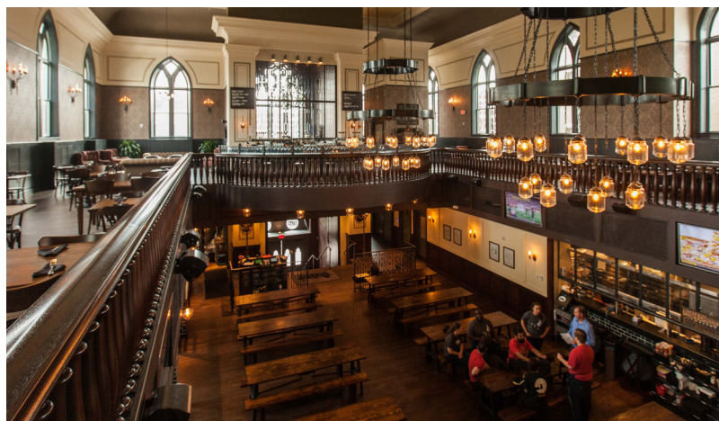
TAFT'S ALE HOUSE

Construction on Cincinnati's new tech epicenter was substantially completed at the end of October 2015, at which time staff members from CincyTech, The Brandery, and Cintrifuse – Union Hall's three tenants – started working out of their respective spaces in the new the new start-up innovation hub at 1311-1315 Vine Street. The $17.5