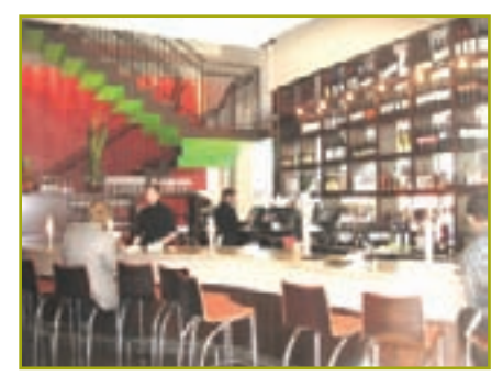
Via Vite Restaurant

Skating Rink: Despite challenging weather this winter, the rink attracted 40,000 skaters to the Square between the end of November through February.