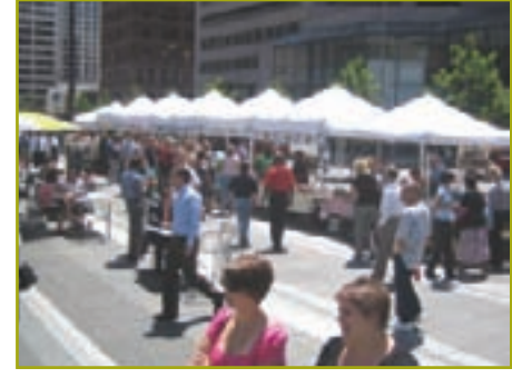
Strauss & Troy Market on the Square

Ice Skating Rink & Broomball: Rink opens the day after Thanksgiving and runs through February with Broomball keeping the Square hopping in January and February