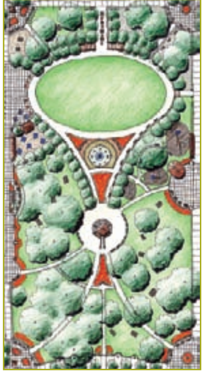
Proposed redesign of Washington Park

The conceptual plan also calls for a 600-700 space, three-level underground garage with parkland on top, similar to Millennium Park in Chicago and Boston Commons. The garage design will be carefully integrated with the design for the park expansion. Merging the garage construction and park expansion will result in substantial savings in the construction process and access to additional private financial resources to help fund the total cost of this approximately $25 million project. In partnership with the Park Board, a team of park and underground garage design professionals has been assembled to develop the plans with a goal of beginning work on the development in early 2009.