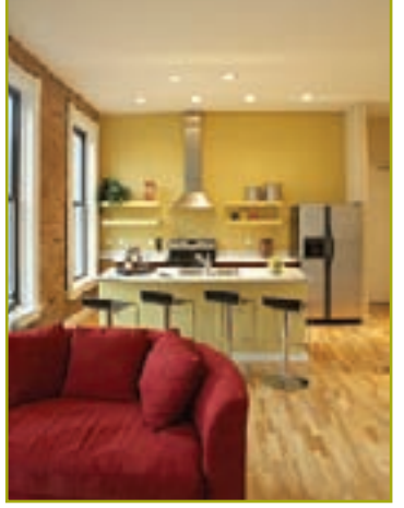
Renovated unit on Duncanson Lofts

Of the 91 condos in Phases I & II, 55 or 60% are sold or under contract.