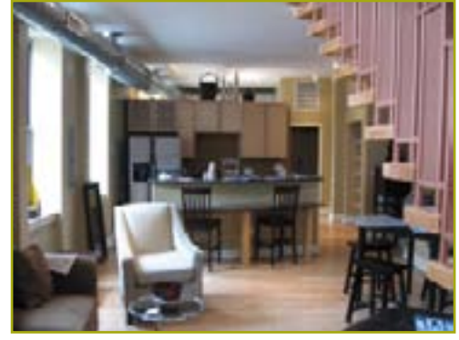
Renovated unit on Bremen Lofts