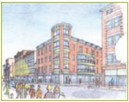
Rendering of Trinity Flats