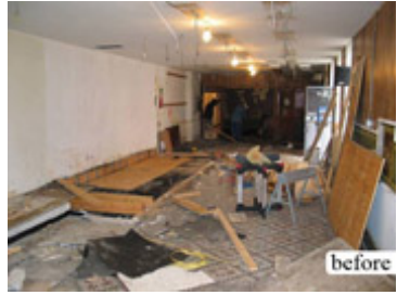
View Larger Image