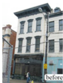
View Larger Image