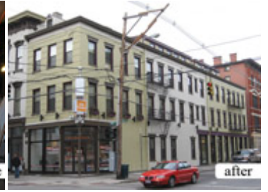
View Larger Image