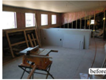
View Larger Image