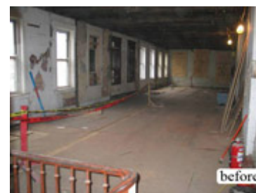
View Larger Image