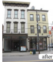
View Larger Image