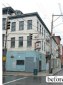
View Larger Image