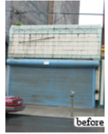
View Larger Image