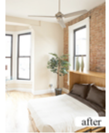
View Larger Image