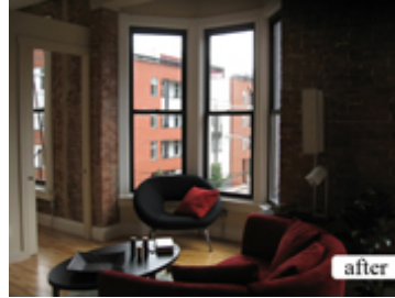
View Larger Image