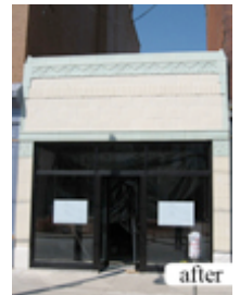
View Larger Image

HOME : ABOUT 3CDC : NEWSROOM : ECONOMIC INCLUSION : CONTACT US