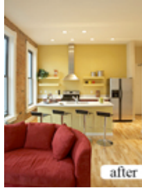
View Larger Image