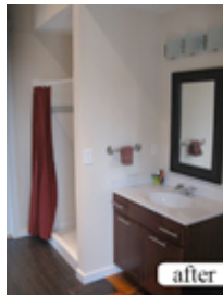
View Larger Image