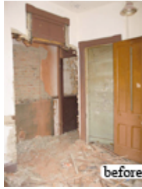
View Larger Image