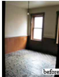
View Larger Image