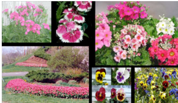
Example of Spring planting