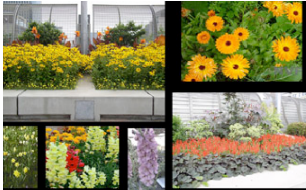
Example of Summer planting