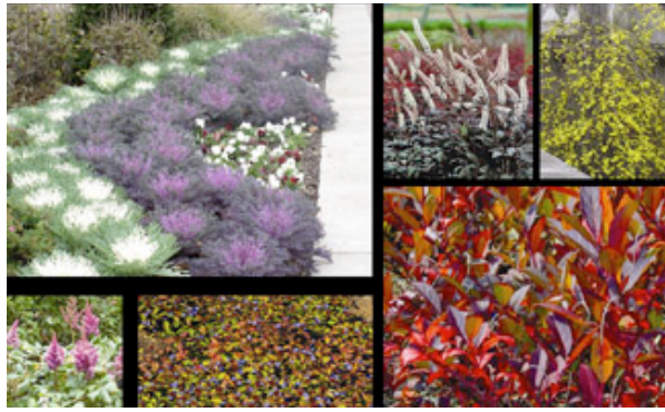
Example of Fall planting