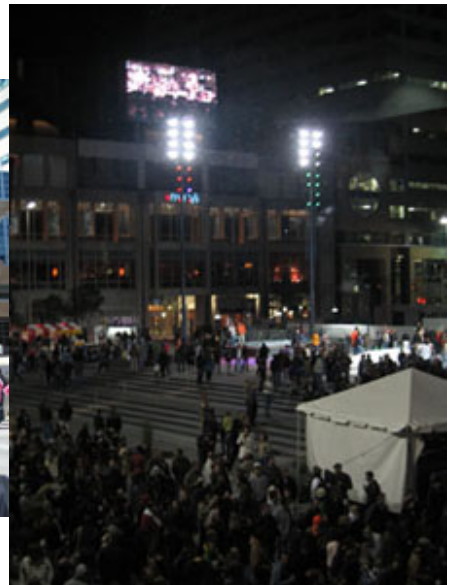
Concert venue after renovation