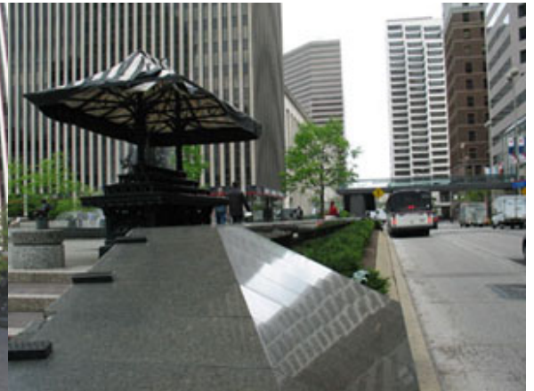
Plaza before renovation