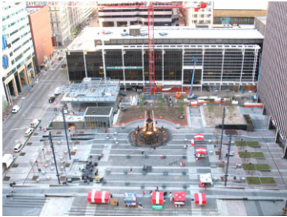
Plaza after renovation