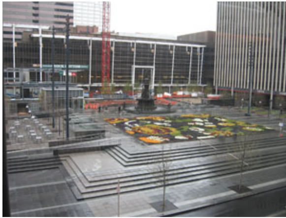
Plaza after renovation