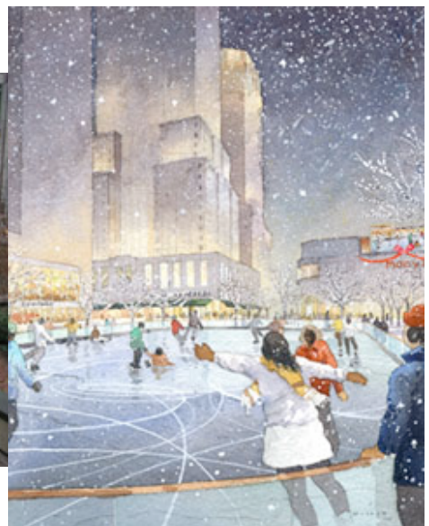
Skating rink rendering