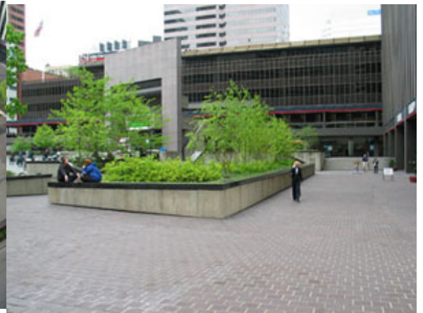
Children's area before renovation