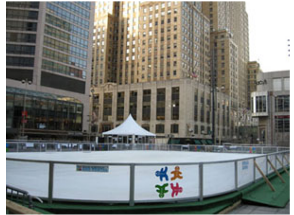
Current skating rink