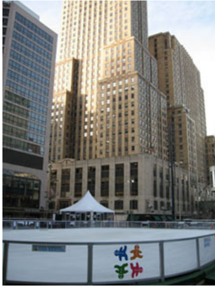
Current skating rink