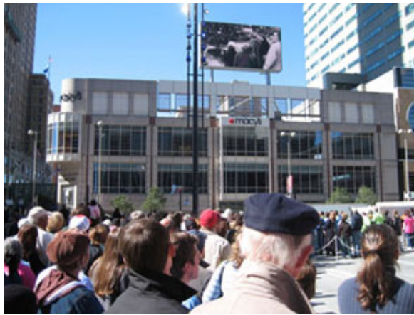
Concert venue after renovation