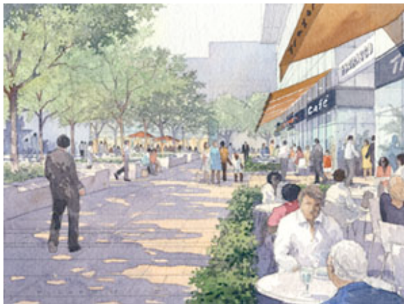
Fifth Third building facade is currently under construction