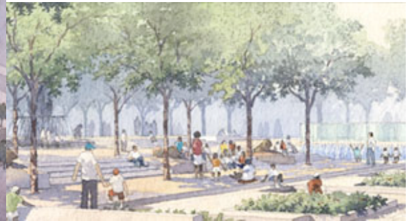
Children's area rendering