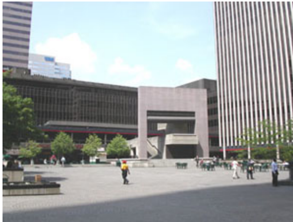
Plaza before renovation