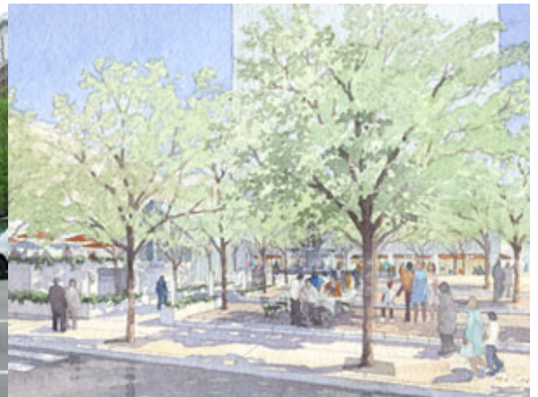
Rendering of seating area