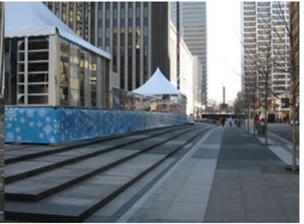
Plaza after renovation