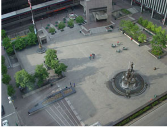
Plaza before renovation