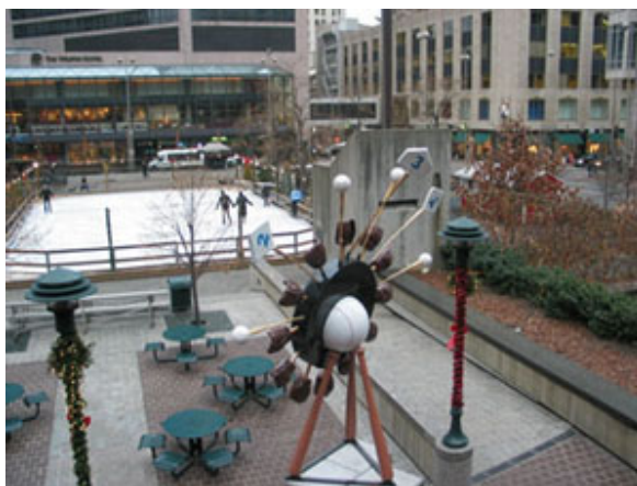
Previous Skating Rink