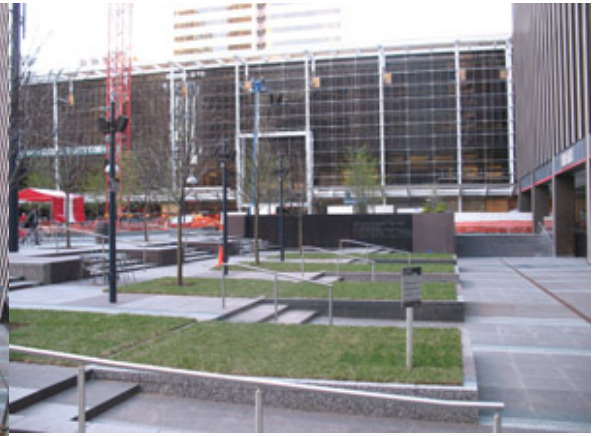
Children's area after renovation