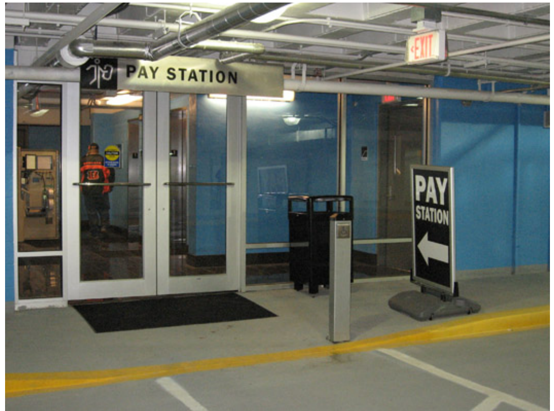
New pay-on-foot machines and way-finding signage