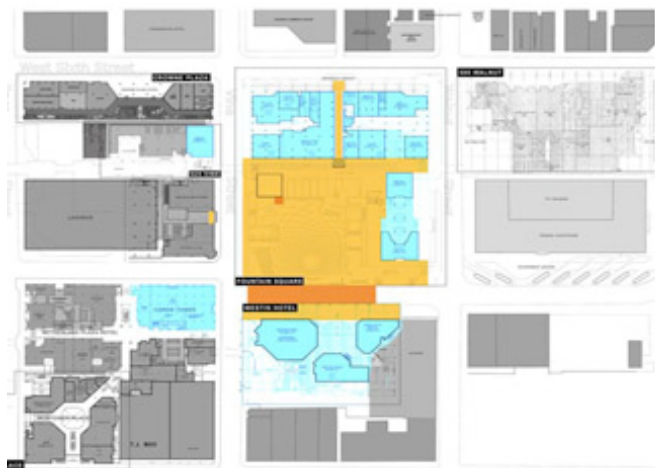
$30 Million - Surrounding Building Renovation