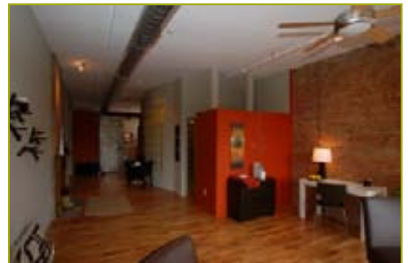
Renovated unit on Duveneck Flats