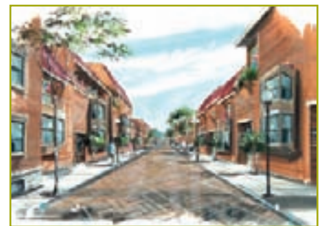
Rendering of City Home project