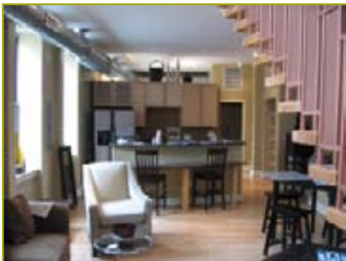
Renovated unit on Bremen Lofts