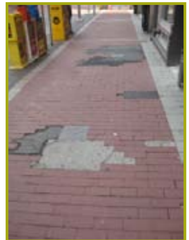
Walnut Street streetscape