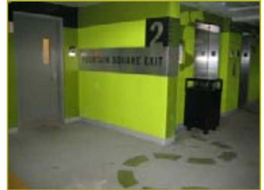
Fountain Square North Garage

Via Vite: The restaurant on the Square opened in October 2007 and has served over 66,000 customers between the opening and June 1.