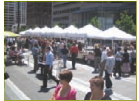
Strauss & Troy Market on the Square

Ice Skating Rink & Broomball: Rink opens the day after Thanksgiving and runs through February with Broomball keeping the Square hopping in January and February