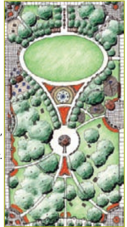
Proposed redesign of Washington Park

In 2008, 3CDC cleaned out a hidden treasure on Vine Street that is destined to become a landmark location in the city of Cincinnati. Cosmopolitan Hall at 1313 Vine St. is a brilliant example of German engineering, architecture and craftsmanship. Built in 1855 Cosmopolitan Hall includes brick, sub basement tunnels and a second floor dance hall/beer garden. It was last used as the Warehouse nightclub, but has been closed for the past several years. Now that the clean up is complete, 3CDC is exploring entertainment uses for the site as well as a possible office development.