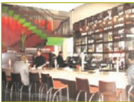
Via Vite Restaurant

Skating Rink: Despite challenging weather this winter, the rink attracted 40,000 skaters to the Square between the end of November through February.