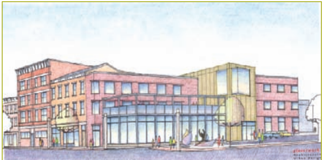
Rendering of Project Beacon

A collaboration of arts groups including Enjoy the Arts, Learning Through Art, ArtWorks and the Fine Arts Fund are moving forward on a plan to consolidate their operations and relocate to the old Elm Industries Building, 1537-39 Race St., under the name "Project Beacon." Working drawings and a State and Federal Historic Tax Credit application have been completed for this $9.7 million project.