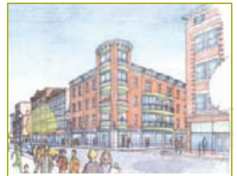
Rendering of Trinity Flats