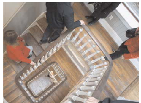
A single-family home at 1420 Race Street, part of Westfalen.