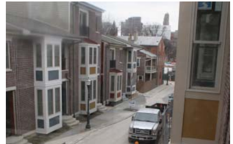
Pleasant Street: Phase II construction of the City Home project.