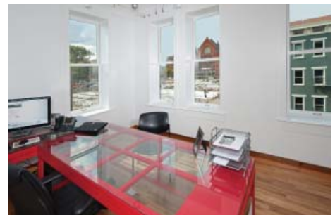
Necco offices at Saengerhalle.