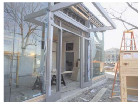
The "Comfort Station" inside the Park's Race Street entrance.