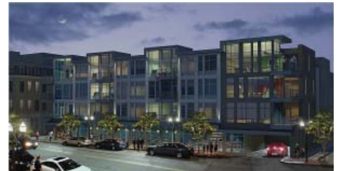
Rendering of new construction on Vine Street.