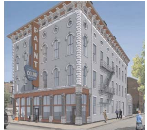
The building that formerly housed Cincinnati Color Company.