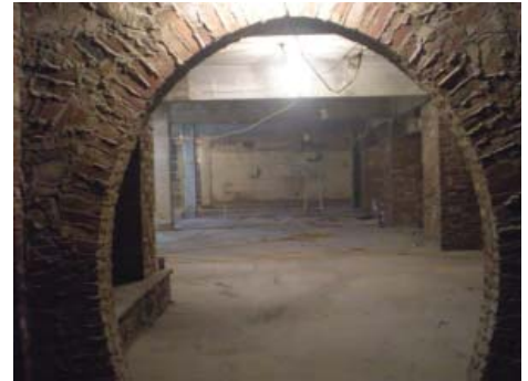
Demolition of the old LaNormandie restaurant space.