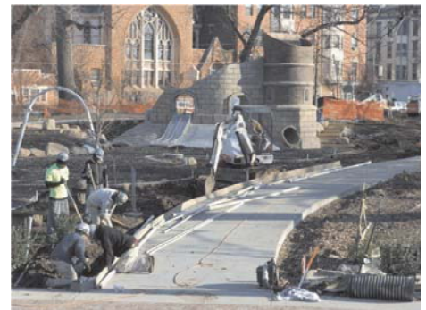
Completing a pathway in the Washington Park Children's Play Area.