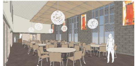
The proposed new YWCA women's shelter dining area.