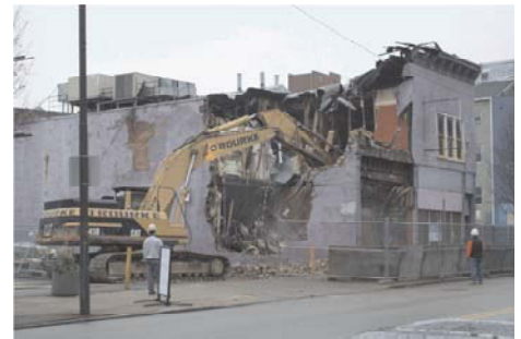
Demolition of the "purple building" on the Mercer Commons site.