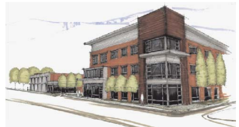
A rendering of the proposed new City Gospel Mission in Queensgate.