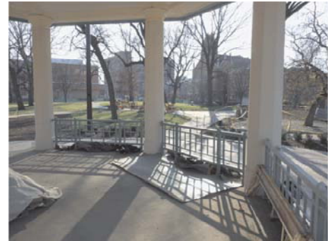
View from inside the renovated historic bandstand.