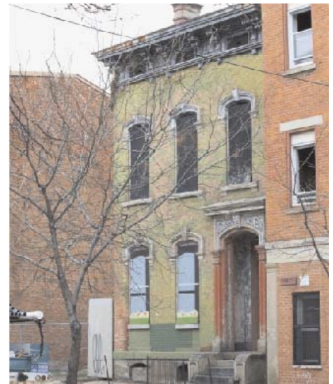
1419 Race Street, recently under contract