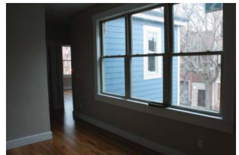
A City Home interior.