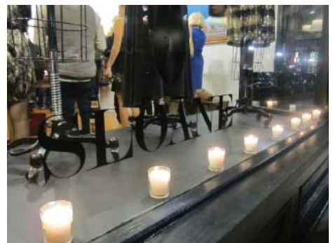
Sloane Boutique on Vine Street.