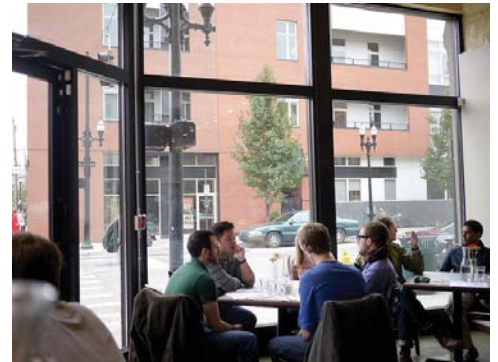
Taste of Belgium