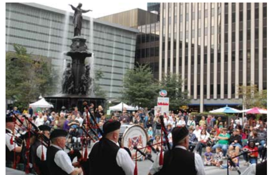
Cincinnati Celtic Festival