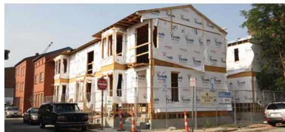
City Home Phase 2 construction