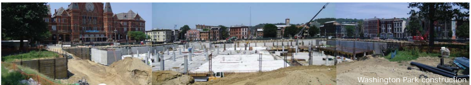
Washington Park construction