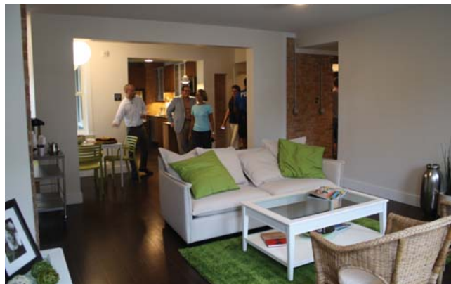
City Home Phase 1b